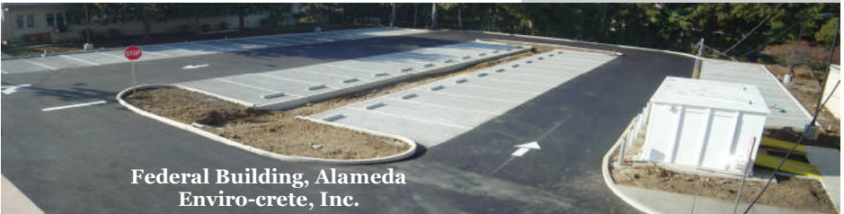
Federal Building, Alameda Enviro-crete, Inc.

The ready mix producers that have supplied these projects are (in photo order): Central Concrete, Milpitas Materials, Las Animas Concrete, Cemex and Precision Concrete Materials. As can be seen, both member and non-member companies benefit from the efforts of the CPCNC to educate designers. We encourage every member of the industry to support this important work.