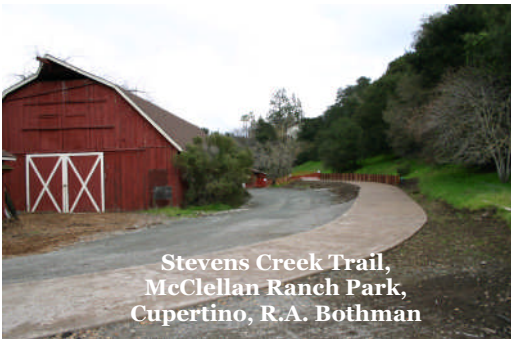
Stevens Creek Trail, McClellan Ranch Park, Cupertino