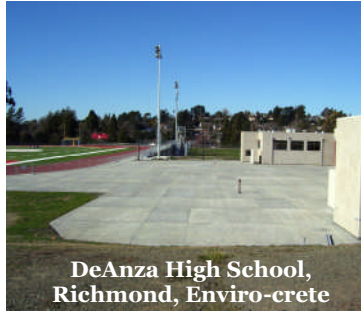
DeAnza High School, Richmond, Enviro-crete

The last number of months have brought in a number of Projects that continue to raise the profile of Pervious Concrete Pavements throughout the region.