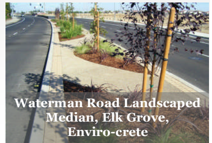
Waterman Road Landscaped Median, Elk Grove, Enviro-crete

> Please contact Rob with any questions on these events at (916) 952-0437 rob@cpcnc.org .